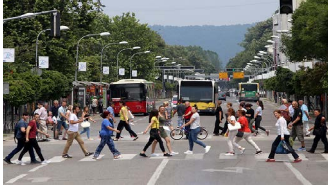
Figure 2. Urban mobility. 'Figure caption' style.